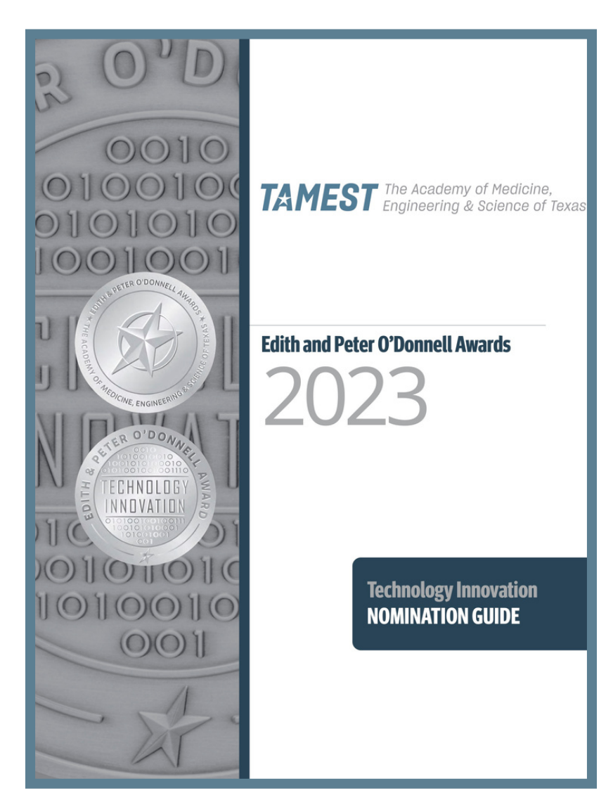
The 2023 Technology Innovation Nomination Guide can be found on our website.