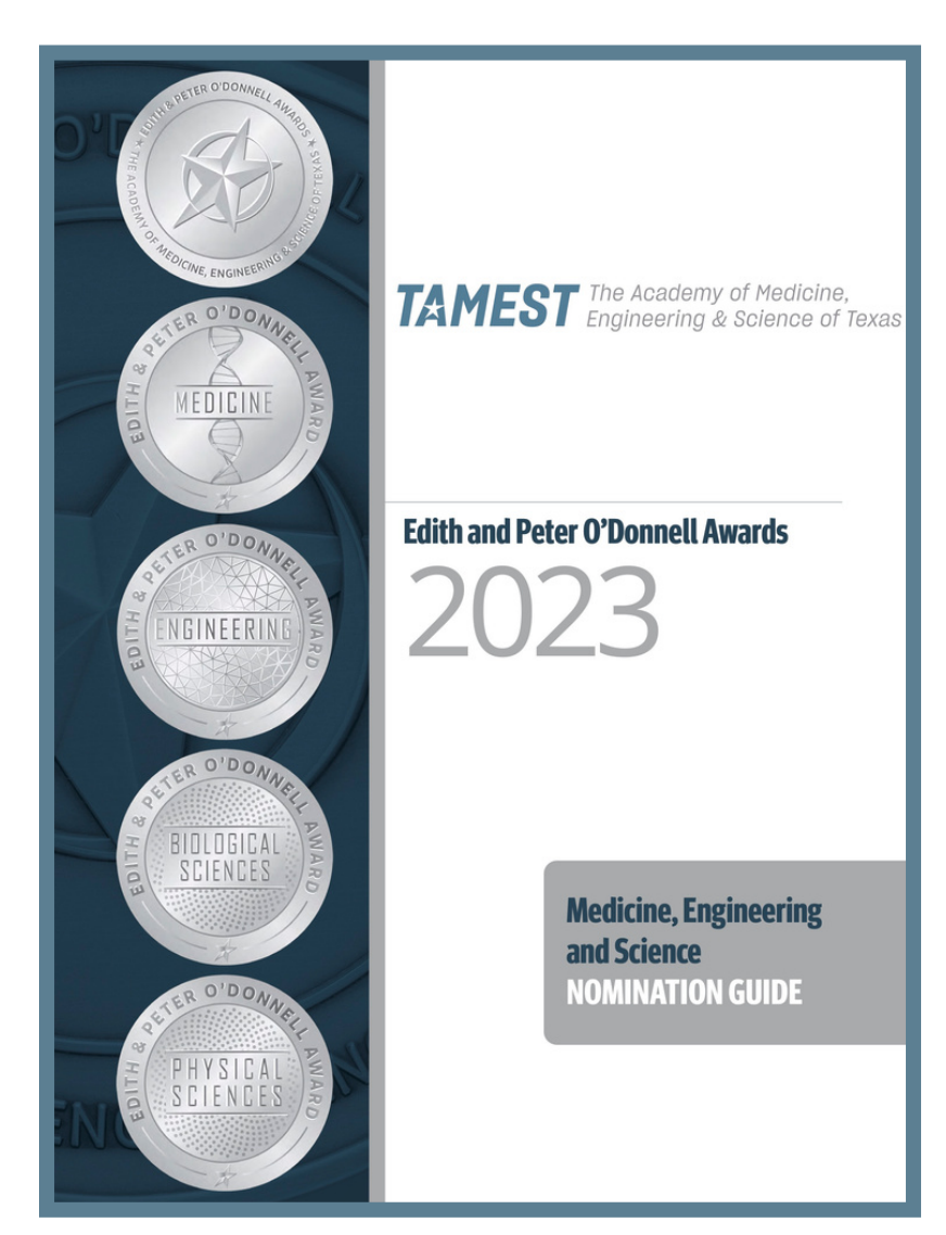
The 2023 Medicine, Engineering and Science Nomination Guide can be found on our website.